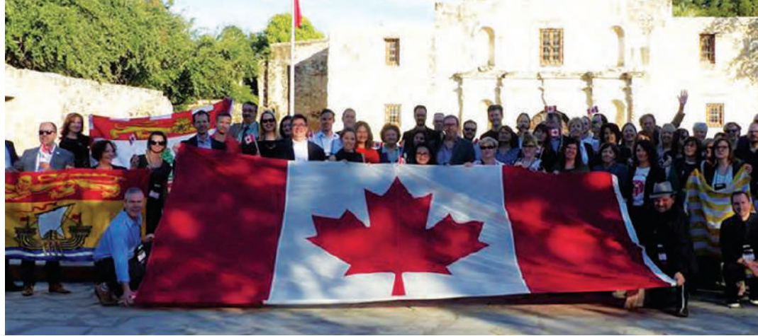
Canadian flag is from the International Downtown Association (IDA) Conference I attended in San Antonio, Texas.