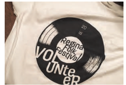
I volunteered for Regina Folk Fest