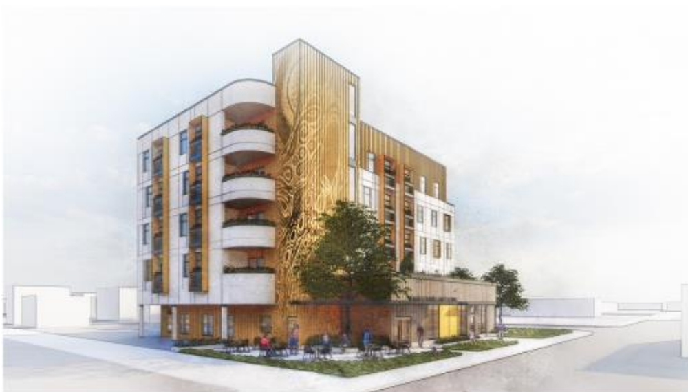
SOUTH WEST PERSPECTIVE

For assistance, or to register your attendance, contact the Office of the City Clerk: clerks@regina.ca or call 306-777-7262.