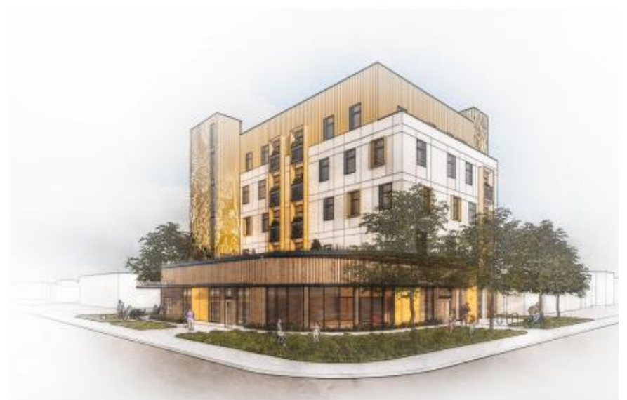
SOUTH EAST PERSPECTIVE