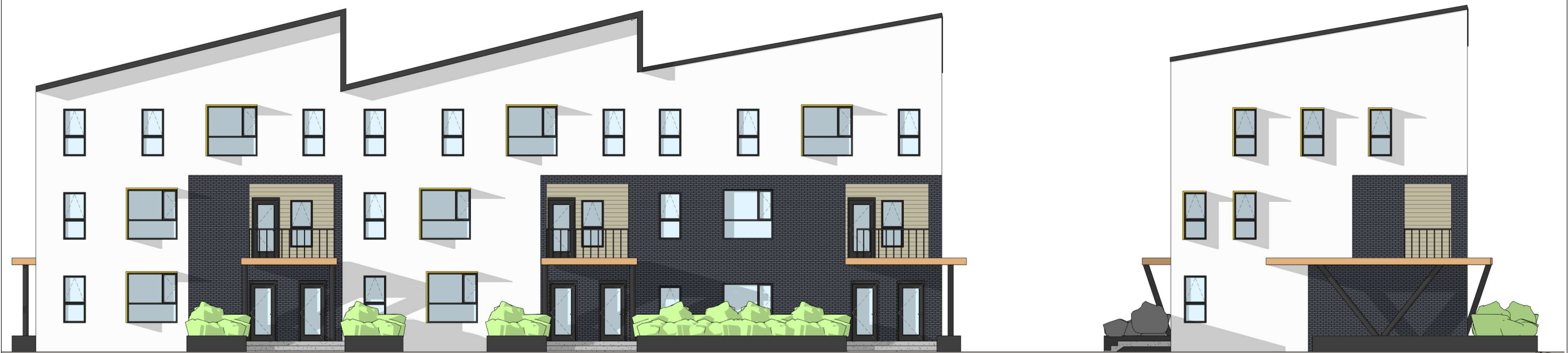
ELEVATION - LORNE STREET 3/16" = 1'-0"