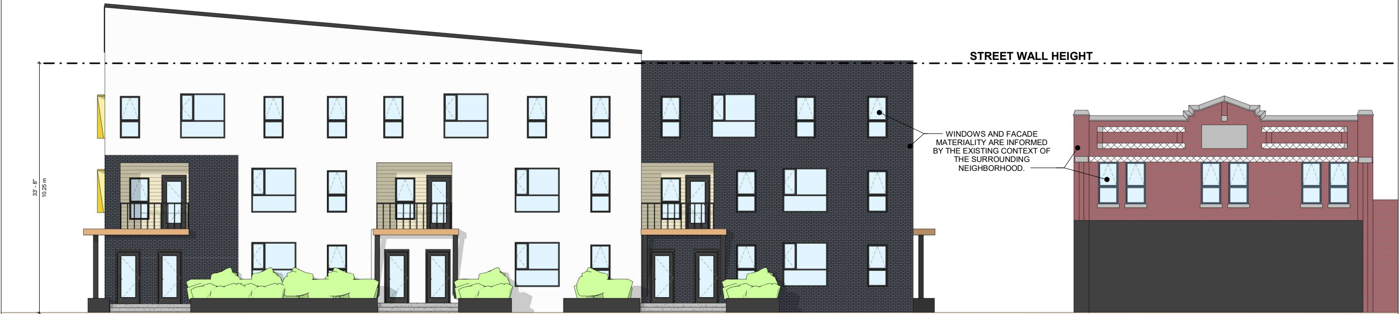
ELEVATION - 11TH AVENUE 3/16" = 1'-0"