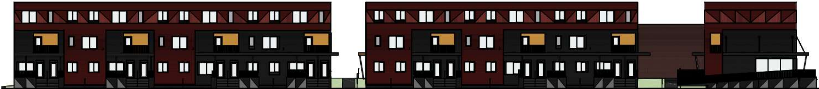
LORNE STREET ELEVATION