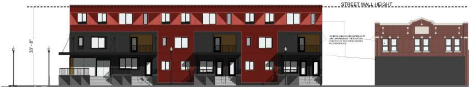
11TH AVE ELEVATION