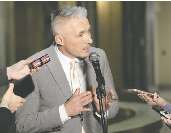
Sask. Environment Minister Dana Skoropad was among those who met with feds.

OTTAWA More than half of the provinces’ ministers have skipped out on a meeting with the feds and Indigenous leaders to discuss halting land and water loss in Canada. Environment ministers from Saskatchewan, British Columbia, Prince Edward Island, Nova Scotia and the Northwest Territories attended the meeting. The other provinces and territories sent their deputy ministers. The Liberal government is leading a 2030 biodiversity strategy to protect 30 per cent of land and water by 2030, but it will be a difficult target to reach without the help of provinces and territories. The federal ministry of environment and climate change says they have a critical role to play because they have significant authority over land use. At the end of 2022 almost 14 per cent of Canada’s land and freshwater and almost 15 per cent of marine areas and coastline were under some kind of conservation protection. The Canadian Press