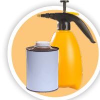
Poisons & Solvents