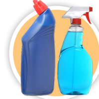
Corrosives & Cleaners