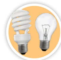
Fluorescent & LED Lightbulbs

Visit the depot located south of the Landfill entrance. Find operating hours on our website: Regina.ca/HHMDepot