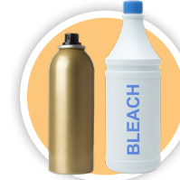
Aerosols & Oxidizers